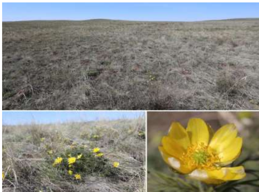
Figure 2. Period of flowering of A. wolgensis in the surrounding of village of Enbek, Akmola region

This plant has pale yellow flowers, oblong, narrow, narrowed at the ends, sometimes weakly toothed, 1-1.5 cm long and 0.5-1 cm wide; however, smaller than those of Adonis vernalis , 15-30 cm tall at the beginning of flowering, lengthening to 30-40 cm after flowering. The rhizome is erect, short, thick, with lace-like brownish-black roots. Stems solitary, with spreading branches; entire plant spreading-hairy, lower leaves brown, scaly, subsequent stem leaves twice pinnate, sessile, with 2 shortened lobes at the base; flowers 3.5-4.5 cm in diameter, petals 17-20 mm long and 6-7 mm wide; bracts globular or ovoid, sometimes drooping; fruits numerous, rounded, vaguely wrinkled, 3-4 mm long, ovoid, slightly wrinkled, pubescent, spout small, hooked downwardly bent. Nuts slightly wrinkled, hairy, about 4 mm long. The species blooms in late March-April, fruits in May-June [13]. It grows along the edges of birch forests and in mountain steppes (Fig. 2).